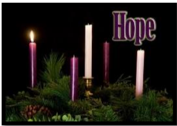
The Candle of Hope

First Sunday of Advent: Sunday, November 29